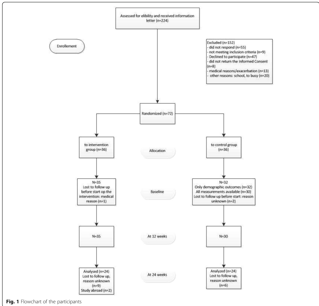
Fig. 1 Flowchart of the participants

activity. Linear mixed models is a statistical model especially used for repeated, longitudinal measures [32] and is a proven, reliable statistical procedure which deals with missing values.