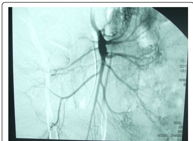
Figure 4 Conventional angiography showed aneurysm in the origin of superior mesenteric artery.

a bruit over subclavian arteries, and angiographic abnormalities. He also fulfills the revised EULAR/PreS criteria for TA [9].