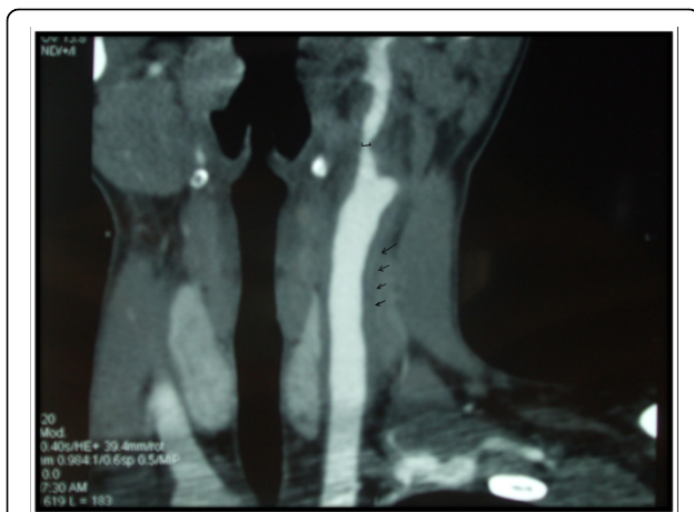
Figure 1 Cervical CT angiography shows regular thickening of the left common carotid artery and left external carotid stenosis.

The hypertension was easily controlled by calcium channel blockers (nifedipine). An antiplatelet agent was prescribed to prevent thrombotic complications. At 3 months after initiation of treatment, the patient remained normotensive. The laboratory tests then revealed normal acute phase reactants, the normalization of renal function, and the disappearance of an abnormal urinary sediment.