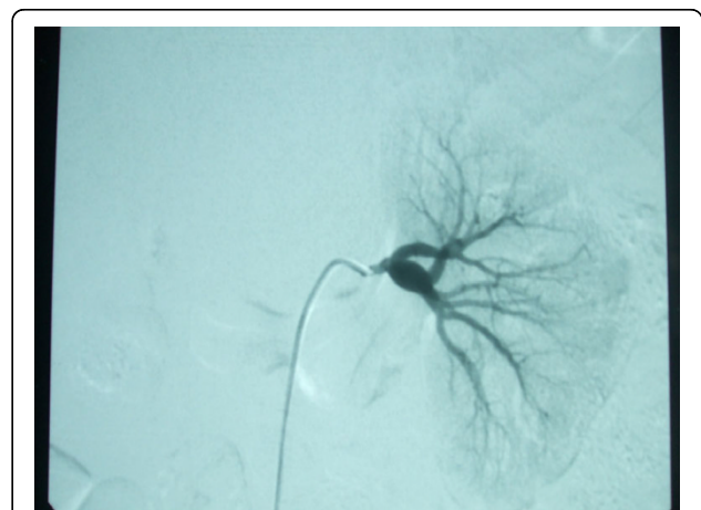
Figure 3 Conventional angiography showed a renal artery aneurysm.

This patient met the American College of Rheumatology criteria [8] which were primarily designed for adult TA detection [9,10]. Four criteria are needed: age less than 40 years, blood pressure difference > 10 mm Hg between upper extremity and lower extremity pressures,