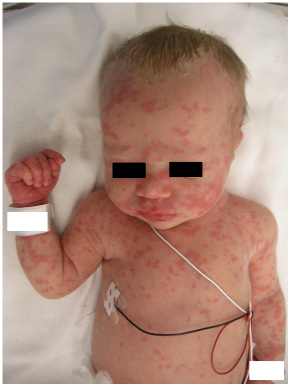
Figure 2 Cutaneous rash in neonatal CINCA syndrome.