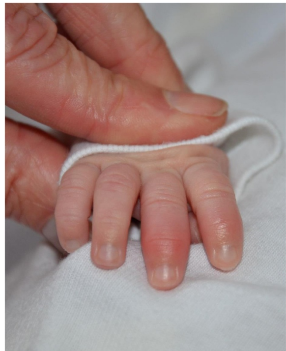
Figure 3 Arthritis in neonatal CINCA syndrome.

antibiotics were stopped after 4 days. CSF showed 36 \times 10^6/L leucocytes and cultures were sterile. Cerebral and abdominal ultrasonographies were normal. On day six she developed arthritis in small joints of hands (Figure 3) and feet. Arthritis, together with the rash and the persisting elevated inflammation markers led to the diagnosis of CINCA syndrome. The patient was discharged home with decreasing urticarial rash but persistent arthritis. On day 32, the girl developed fever ( 38.2^\circ\text{C} ), with CRP rising to 222 mg/L. This severe evolution prompted parents to accept treatment with anakinra at 39 weeks postmenstrual age. The goals of this treatment were to get the patient free of symptoms and to suppress the inflammatory reaction and reaching normal CRP values. To achieve these goals the dose had to be increased temporarily to 20 mg/kg/d which was well tolerated. At 2 months, therapy was switched to canakinumab, 8 mg/kg sc, every 5–6 weeks without symptoms or increase of inflammatory parameters [11]. At 20 months, neurodevelopment, brain MRI, AEPs and ophthalmologic examination were normal. In the NLRP3 -gene a heterozygous mutation for F566L (p.Phe566Leu) was identified [10].