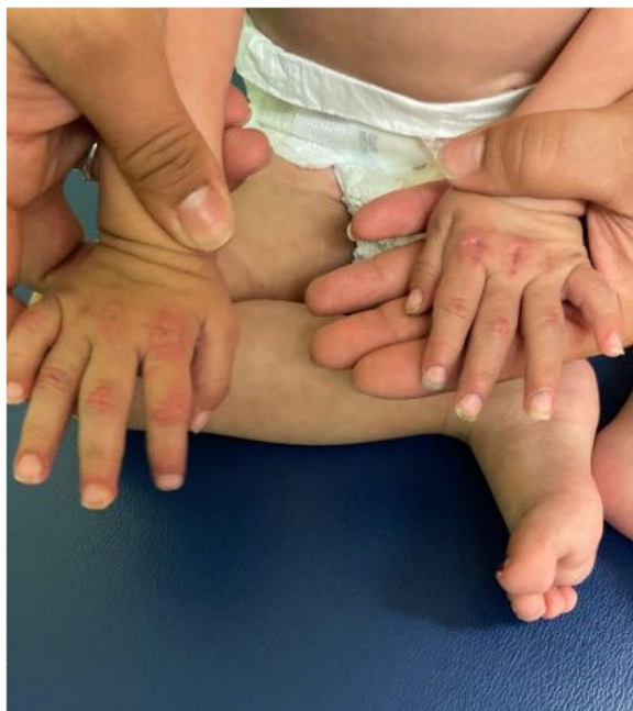
Fig. 2 Symmetric ulcerative Gottron's sign and nail fold erythema