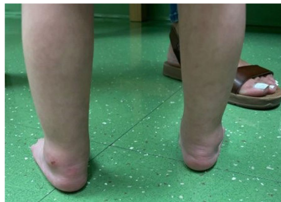
Fig. 3 Ulcerative lesion of L ankle

due to hypoxia on hospital day three and she continued to have an oxygen requirement throughout the hospital course.