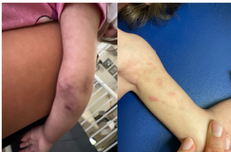
Fig. 1 Ulcerative violaceous macules of R elbow, L arm