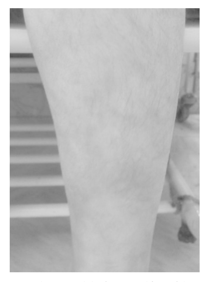
Fig. 1 Livedo racemosa on the leg of patient one, a deficiency of adenosine deaminase 2(DADA2) patient

Patient one presented at five years with an episode of stroke, livedo racemosa, and increased inflammatory marker levels (Fig. 1). She was primarily diagnosed with neuro-Behcet's disease, since her father (patient 11) had been diagnosed with Behcet's disease and she had positive HLA B5 and HLA B51. She was being treated with methylprednisolone pulse and azathioprine. She continued to present episodes of stroke with evidence of hemorrhagic components and vascular nature on MRI. Laboratory evaluations showed elevated platelets, ESR, CRP, and negative c-ANCA, p-ANCA, anti-dsDNA,