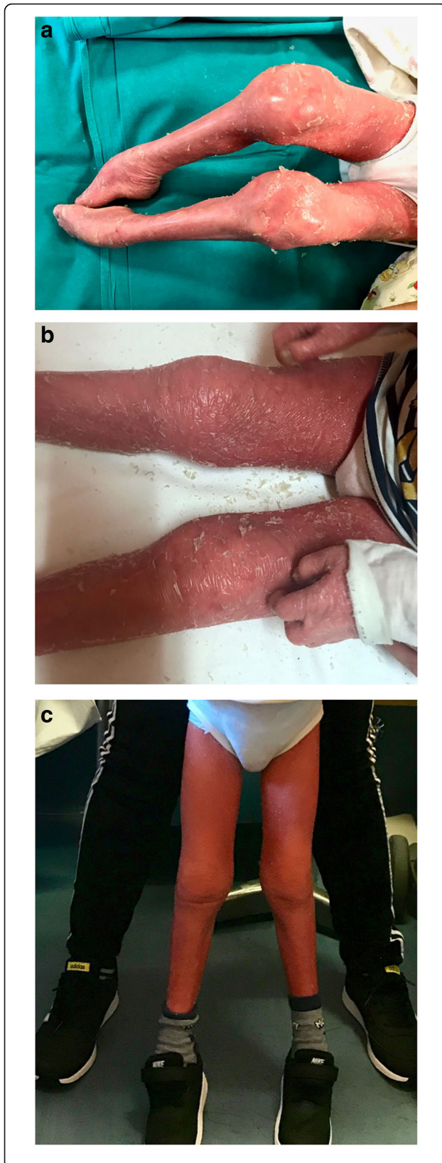
Fig. 1 a-b-c: Severe arthritis in a 4 years old boy affected by Harlequin Ichthyosis. a. At visit 0 in our Clinic. b. After 2 months from the first multiple intraarticular steroids injection. c. After 8 months from the beginning of etanercept