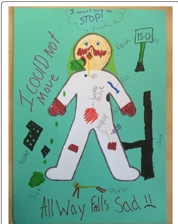
Fig. 1 A drawing representing participant’s experience of Juvenile Dermatomyositis. Children and young people were given the option of drawing how they view the effects of Juvenile Dermatomyositis on their body, either as part of the interview (a warm up activity) or if they did not want to talk, instead of the ‘standard interview’. They were offered a blank ‘bodymap’ and encouraged to complete however they wanted to, whether in text or drawing. The young person who completed this example, explained that they were drawing; the rash on the hands and face and knees, the biopsy site, the intravenous line in situ, constant tummy ache, vomit due to the medicines, tablet packets, scales (as they had lost so much weight) and a chair which they required as they couldn’t stand. They went on to write on their picture “I could not move”, “Always feel sad” and a thought bubble showing “I want this to STOP”

process continues; words are added to make the text readable and finally crafted keeping the data true to its original meaning whilst showing what the researcher is interpreting. In this study, this resulted in fifteen narratives, one from each participant. These were then plotted alongside each other looking for shared meaning within each of the voices. Subsequently, an overarching phenomena which captured living with JDM was identified with five shared themes within it, and these themes were then plotted together as separate narratives to complete the data analysis. The themes were reviewed as they developed by both the lead researcher PL and doctoral supervisor FG: data saturation was felt to be reached at fifteen interviews.