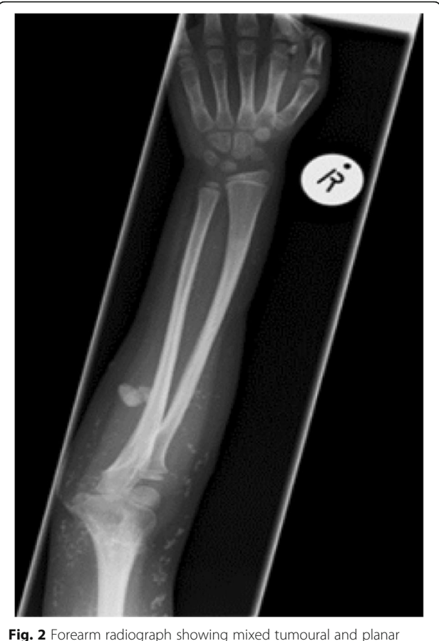
Fig. 2 Forearm radiograph showing mixed tumoural and plana calcinosis in one of the JDM patients

duration of follow up among patients who developed calcinosis and those who did not have calcinosis. The median time to diagnosis from symptom onset was longer in children who had calcinosis (6 months) than