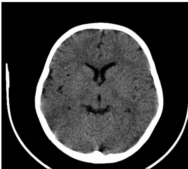
Figure 2 CT brain reveals multiple areas of abnormal hypodensity in the subcortical white matter of both hemispheres.

just at the central sulcus in keeping with the effects of hypertensive encephalopathy ("PRES").