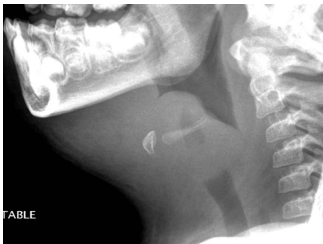
Figure 1 A lateral neck radiograph demonstrates a profoundly swollen epiglottis and complete airway obstruction.

resonance imaging (MRI) brain demonstrated extensive T2 signal changes throughout the white matter with diffuse cerebral edema involving both cerebral hemispheres (Figure 3). A diagnosis of probable posterior reversible encephalopathy syndrome (PRES) was made.