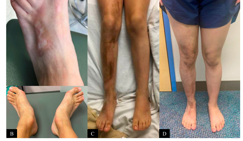
Fig. 4 Features of localized scleroderma. A Patient 2's damage features of localized scleroderma include visible venous pattern resulting from epidermal and dermal atrophy. There is a plaque of bound down, sclerotic skin causing hyperpigmentation, sclerotic bands, atrophy, and contractures. B As a sequela of fascial and tendon fibrosis as well as joint ankylosis, she also has bilateral severe flatfoot deformity with hindfoot valgus. C Patient 3's initial diagnosis image including active right leg linear scleroderma with hyperpigmented plaques with central thickening surrounded by outer erythema. D Patient 3's current physical examination shows late-stage morphea damage features including right lower extremity dermal atrophy with visible vessels, subcutaneous atrophy, dyspigmentation, decreased leg circumference, mild right ankle flexion contracture, and non-significant leg length difference (8 mm)

Patient 5 had a history of Hashimoto thyroiditis, environmental allergies requiring immunotherapy, food allergies, and inherited mild factor XI deficiency. EF was diagnosed within three weeks of symptoms, including generalized edema, limitation of her bilateral shoulders, fingers, wrists, and decreased ability to squat. MRI of her bilateral thighs exhibited circumferential, uniform thickness edema-like signal along the intermuscular fascial planes diffusely about the pelvis and thighs. She was treated with IV methylprednisolone (1000 mg total for one dose), prednisone (maximum dose of 40 mg daily,