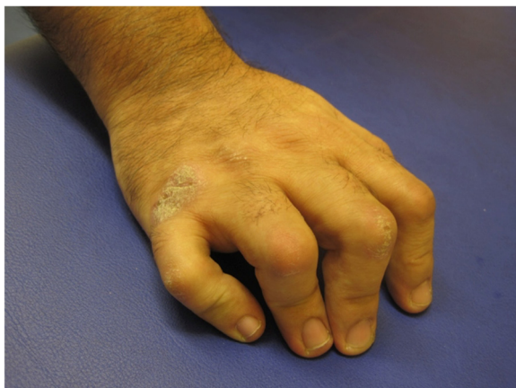
Fig. 2 Right hand of the patient's father. Camptodactyly in all fingers. The father has a more extended form of camptodactyly. It demonstrates the variable presentation of the camptodactyly and clinical variability of the CACP syndrome even within families