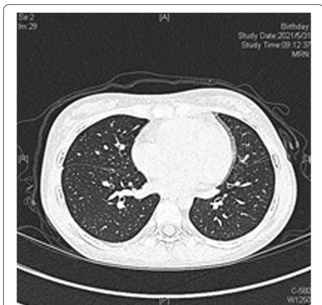
Fig. 2 Chest high-resolution computed tomography (HRCT) images reveal thickening of the pericardium with mild pericardial effusion. No definite evidence of pulmonary nodules and associated pleural effusion. Neither bronchiectasis nor areas of air-trapping was showed

We started treatment with intravenous pulses (11 mg/kg/day) of methylprednisolone for three consecutive days. Two days later, she received cyclosporine due to persistently elevated CPK levels. Mycophenolate mofetil